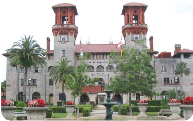
The Lightner Museum formerly the Alcazar Hotel construction completed in 1887

How many architectural elements can you name?