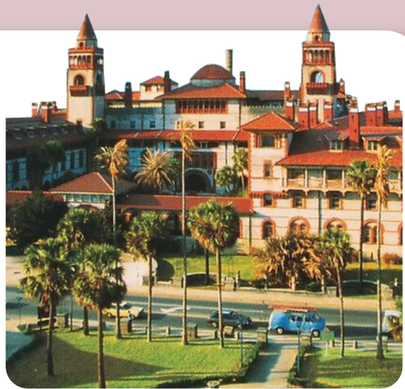
Flagler College (Formerly the Ponce de Leon Hotel) construction completed in 1888

In the skyline of St. Augustine, Spanish architectural elements are visible everywhere - terracotta roofs, columns, arches, stucco walls, balconies and domes. Many of the elaborate structures were built by oil tycoon Henry Flagler to attract tourists to his hotels during the prosperous late 1800s. Spanish houses of the early 16th century, though, were built of simple materials - posts and beams, wattle and daub construction. Back then, both horse and rider entered the homes through walled gardens, much like our modern-day garages! Few remnants of the original Colonial buildings exist. The historic streets of St. Augustine are organized in a grid pattern, running north/south, east/west. This city planning design, which dates back to the Romans, allowed military troops to easily find their way through towns as they conquered and established new territories.