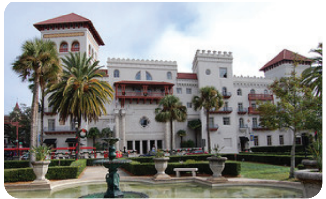
The Casa Monica Hotel formerly the Cordova Hotel construction completed in 1888